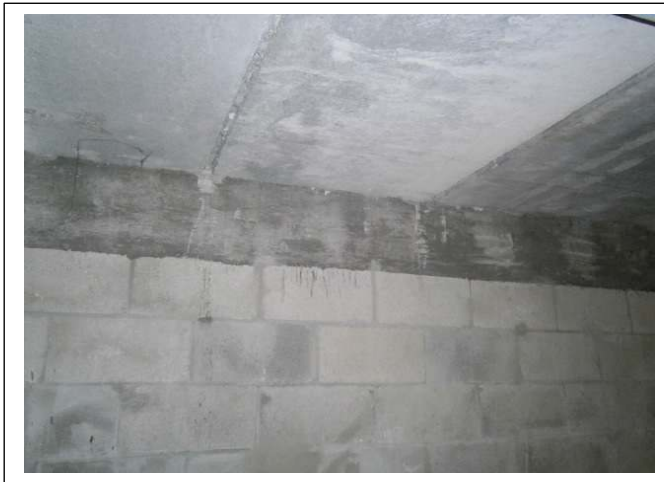
REINFORCED CONCRETE ROOF DECK & REINFORCED CONCRETE WALLS