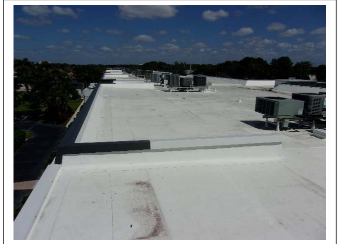
ROOF COVERING SYSTEM – The roof covering system is fully functional with no deficiencies observed. The mechanical devices appear to be properly secured.