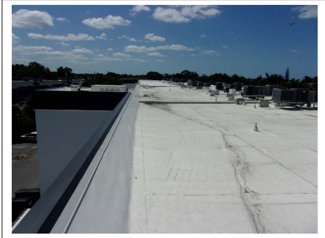
ROOF COVERING SYSTEM – The roof covering system is fully functional with no deficiencies observed. The mechanical devices appear to be properly secured.

R3 of Florida, LLC P.O. Box 152205 Cape Coral, FL 33915 Office: 239.810.7793 Email: radjrsas@yahoo.com