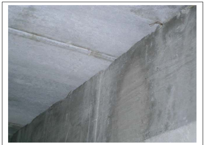
REINFORCED CONCRETE ROOF DECK & REINFORCED CONCRETE WALLS