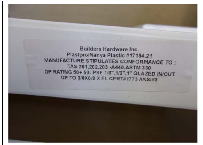
OPENING PROTECTION – The glazed front entry door is large missile rated. FBC# FL17184.21