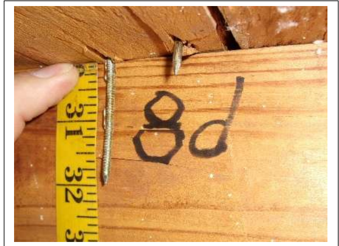
ROOF DECK ATTACHMENT – 8d ring shank nails added in 2021