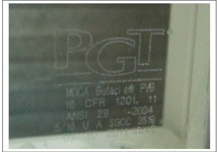
OPENING PROTECTION – The sliding door's product approval. MDCA NOA# 17-0420.13