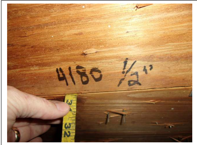
ROOF DECK THICKNESS – ½ inch plywood

R3 of Florida, LLC P.O. Box 152205 Cape Coral, FL 33915 Office: 239.810.7793 Email: radjrsas@yahoo.com