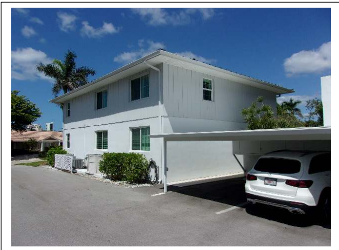
REAR ELEVATION VIEW