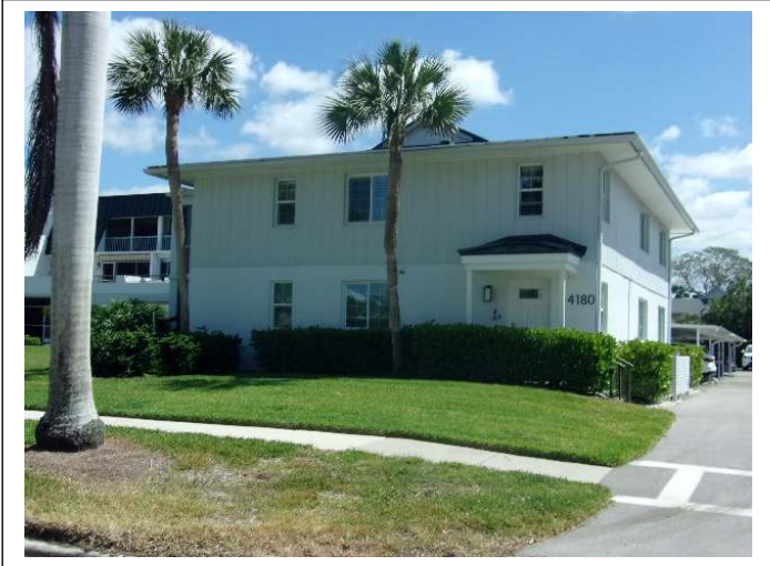
FRONT ELEVATION VIEW

R3 of Florida, LLC P.O. Box 152205 Cape Coral, FL 33915 Office: 239.810.7793 Email: radjrsas@yahoo.com