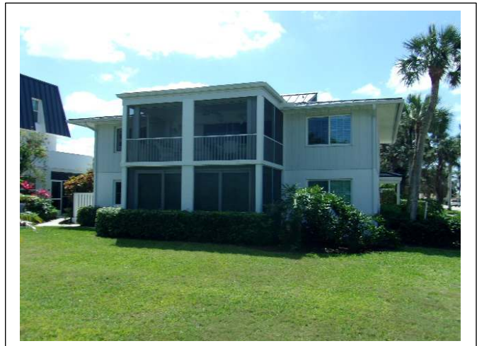
SIDE ELEVATION VIEW

Harborside Terrace Condominium Association 4180 Belair Lane, Unit A & B, Naples, FL 34103 03-22-2023