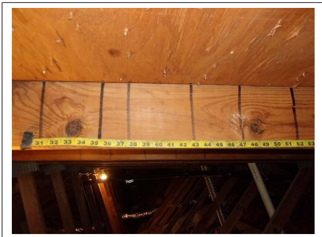
ROOF DECK ATTACHMENT – 8d nails within 6 inches along the edge