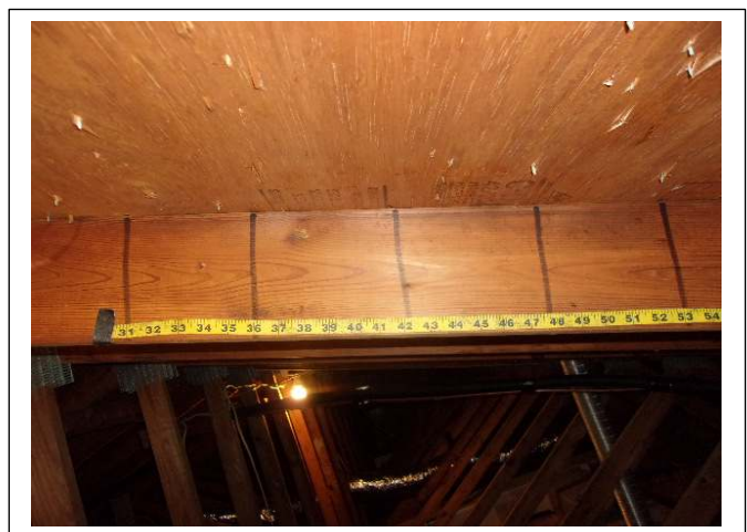
ROOF DECK ATTACHMENT – 8d nails within 6 inches in the field

Harborside Terrace Condominium Association 4180 Belair Lane, Unit A & B, Naples, FL 34103 03-22-2023