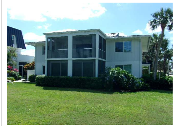
ROOF TO WALL ATTACHMENT – Metal non-wrapping straps properly secured with a minimum of 3 nails = Clips