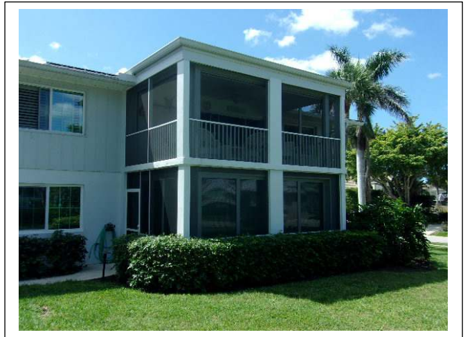
SECONDARY WATER RESISTANCE – A polymer adhesive (peel & stick) SWR Barrier was installed in 2021