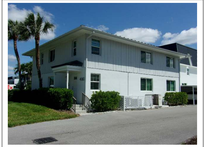
SIDE ELEVATION VIEW